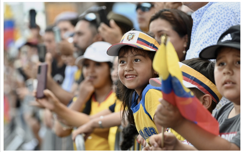
Figure 1: Ecuadorian day parade in Jackson Heights, NY (Parry, 2022)